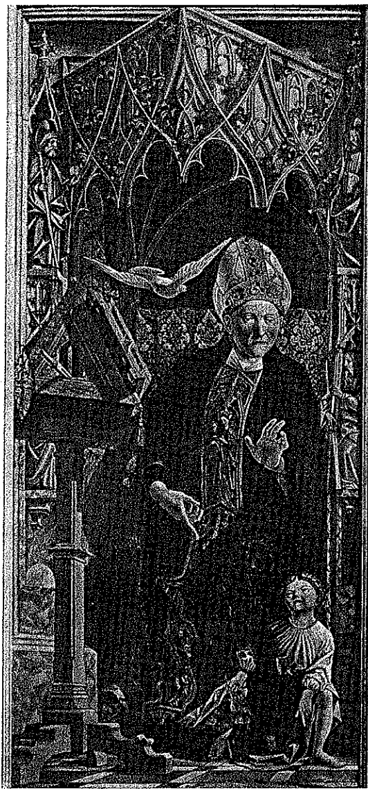
Saint Augustine by Michael Pacher, Alte Pinakothek, Munich, West Germany.