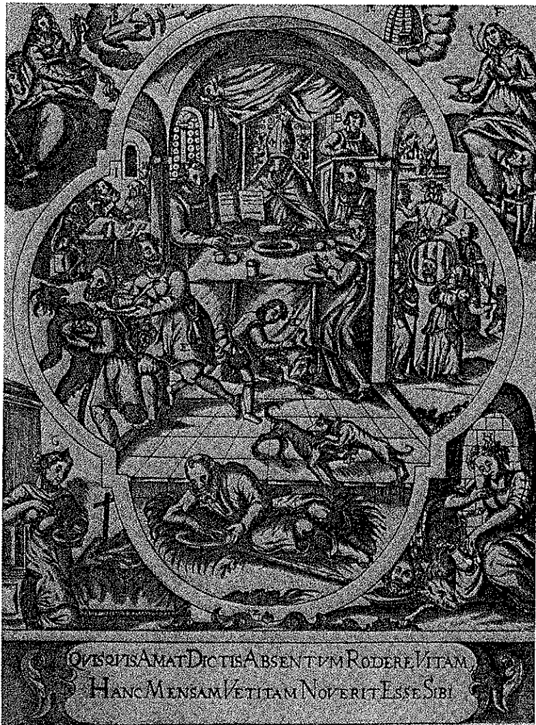
Augustine teaches charity: "Let those who like to slander the lives of the absent know that their own are not worthy of this table" (Wandereisen Engravings, 1631).

2 His meals were frugal and economical; at times, however, in addition to herbs and vegetables they included meat for the sake of guests 2 or sick brethren. Moreover, they always included wine, for he knew and taught, with the Apostle, that everything created by God is good, and nothing is to be rejected if it is received with thanksgiving; for then it is consecrated by the word of God and prayer (1 Timothy 4:4-5). 3 Holy Augustine expressed the same thought in his Confessions 3 when he said: "It is the uncleanness of gluttony that I fear, not unclean meat. For I know that Noe was allowed to eat all kinds of meat that were suitable as food (Genesis 9:24); that Elias was fed on meat (1 Kings 17:16); and that John the Baptist, remarkable ascetic though he was, was not polluted by the flesh of living creatures, the locusts which were granted him as food (Matthew 3:4). On the other hand, I know that Esau was defrauded by his greed for a dish of lentils (Genesis 25:29-34); that David reproached himself for longing for a drink of water (2 Samuel 23:15-17); and that Christ our King was tempted not by meat but by bread (Matthew 4:3). And the people in the desert deserved rebuke, not because they wanted meat, but because in their greed for food they sulked